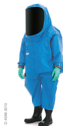
Dräger CPS 7900, blue