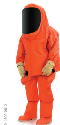
Dräger CPS 7900, orange

The CPS 7900 reduces the stress during the already difficult work in hazard zones and danger areas. With its new, ergonomic cut and five available sizes, the suit offers its wearers with a body height of 1.50 m to 2.10 m the highest degree of mobility during a wide variety of activities and tasks. The suit is designed to be used in conjunction with other Dräger protective gear such as the current Dräger PSS 7000 or HPS 6200 as well as older products. (Working with the BG-4 CCBA is not a problem either) Moreover, the clearly lighter weight and better drape of the suit