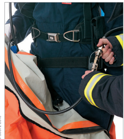
Connection of the air line with the SCBA inside of the suit