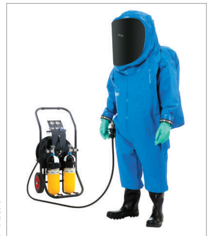
Dräger CPS 7900, blue with Dräger PAS AirPack I

This makes activities carried out in especially warm temperatures, e.g. traffic accidents on the interstate in the middle of summer, significantly less stressful for the cardiovascular system of the wearer. In addition, the system can also be used to have a fully equipped rescue team on stand-by without losing breathing air and with minimized thermal stresses.