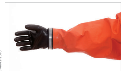
Previous EN combination