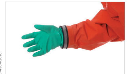
New EN combination