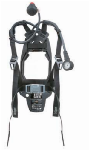
Dräger PAS® Lite

Incorporating new materials that are shaped and formed to provide maximum comfort at both the shoulders and the waist, the carrying system has been developed to reduce back strain, stress and fatigue. The innovative harness design ensures an excellent weight distribution at the shoulders. The inclusion of durable rubber coated fabric provides excellent wearing comfort and chemical resistance, whilst also performing well during the flame engulfment test in line with EN137 Type 2.